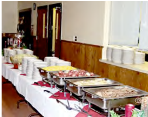
Pictured above: Northwest Sports Complex Ice Arena, Weight Room and Banquet Hall.