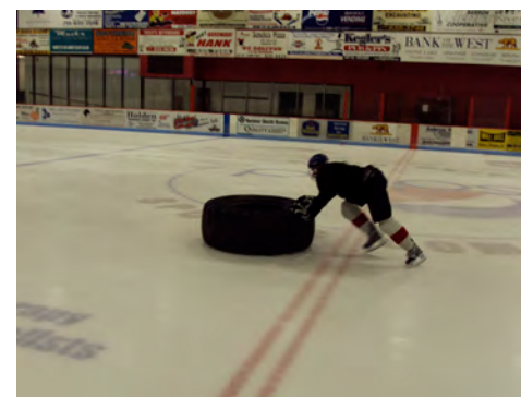
Pictured above: Hockey School campers working on on-ice resistance training. Pictured to the right: on ice activity.