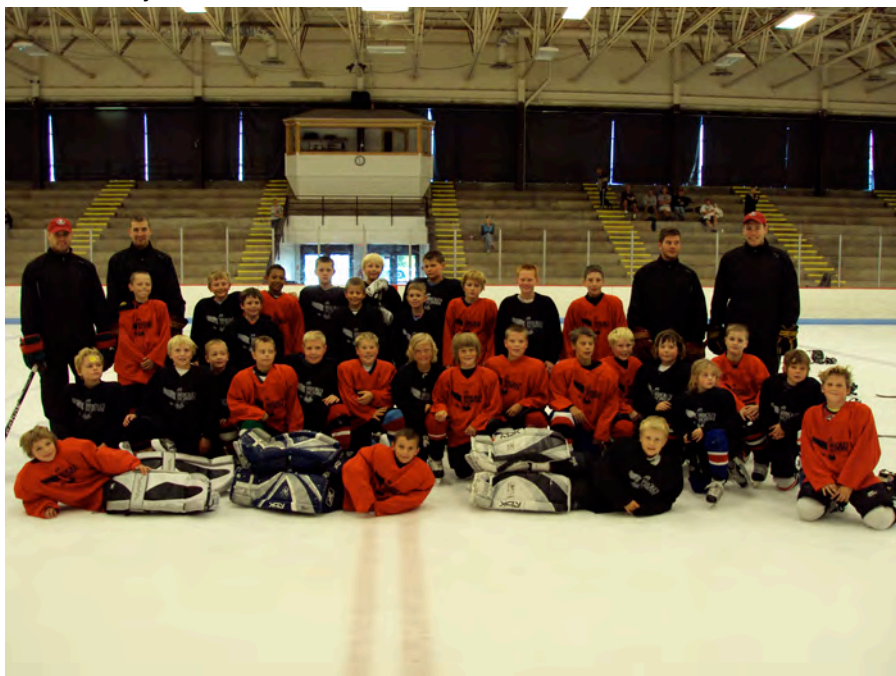
Pictured Above: Boys Group 1 with The Hockey School coaches in 2009